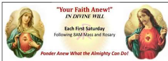
Our Next Topic: How Love for Jesus forms the transformation of the soul in Him.

Please join us on Saturday, October 1, after the 8 am Mass for the third meeting of St. Faustina's newest ministry, "Your Faith Anew".