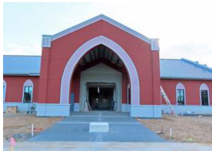
The photo on the left shows the concrete pedestal that will display our Divine Mercy statue.

We'll announce an initial meeting to get things rolling shortly. As always, "Thank You!" for your continued support for our St. Faustina parish