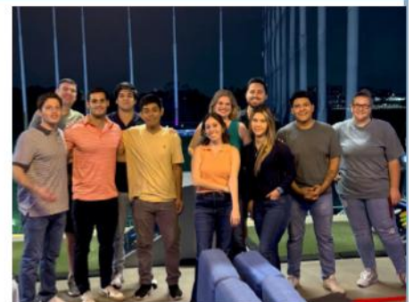
Miembros en una reciente salida a Top Golf. Members on a recent outing to Top Golf

El Grupo de Jóvenes Adultos de Santa Faustina busca miembros — ¿Eres un joven adulto de 18 a 34 años que busca profundizar su fe y conectarse con compañeros de ideas afines? ¡Únete a nuestro vibrante Ministerio Católico de Jóvenes Adultos! Nos reunimos todos los miércoles a las 7:30 p.m. en la Iglesia Católica de Santa Faustina. Explora tu camino espiritual a través del servicio comunitario, el culto, el compañerismo y los eventos sociales. ¡Esperamos verte allí!