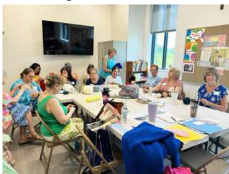
Members of the Caring Crafters combine, hard work, fun, love, and fellowship during their monthly meetings.

The Caring Crafters want to thank all those parishioners who donated yarn, fabric and supplies to their ministry. They