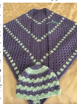
Prayer Shawl and Chemo Cap

To learn more about the mission of Hands of Hope American, Inc., please go to their website at: Home - Hands of Hope America