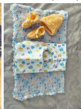
Baby blanket, bib and hat