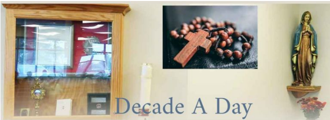
Decade A Day

Do you have about five minutes a day to pray a “DECADE A DAY”? This is a program in which 20 people each say one decade of the Rosary every day of the year, for one year. Each member signs up for one decade, and prays that decade every day. For example, if my decade/mystery was the Visitation, then that is the Decade I would say each day.