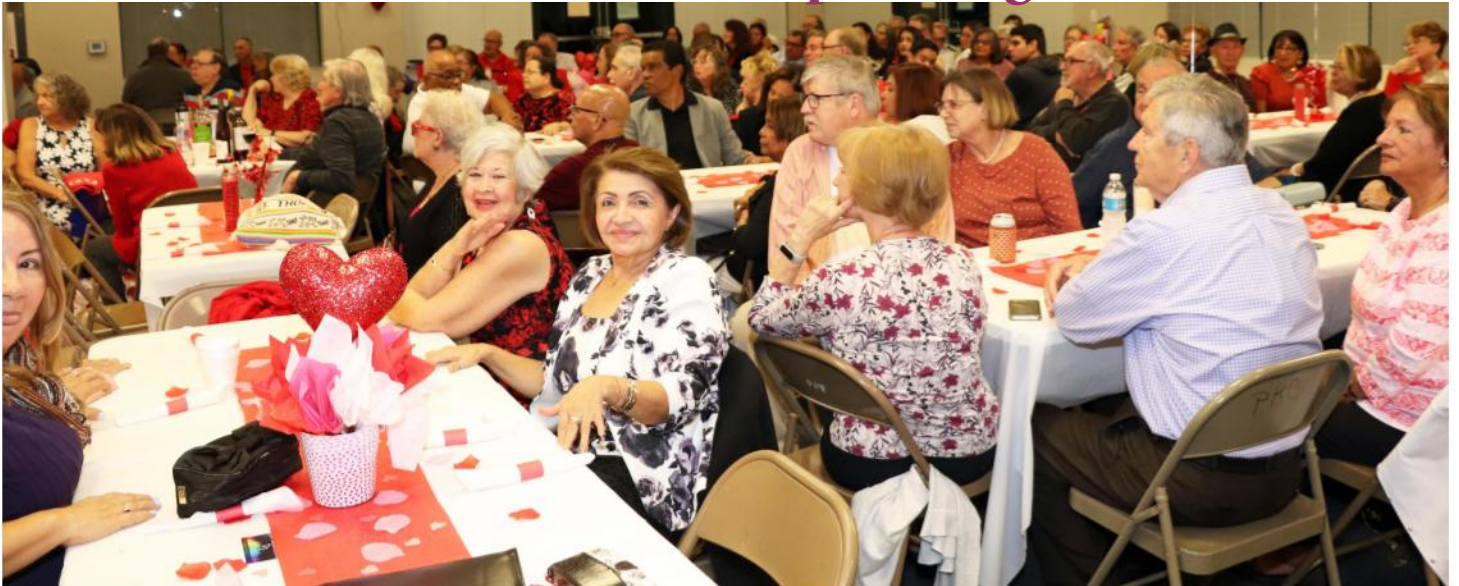
The parish held an official "goodbye" to our space at Glenbrook Commons on Saturday, February 18, by holding a Valentine's Party. It was the last event for the space the we've occupied since the first Mass there on December 19, 2015.