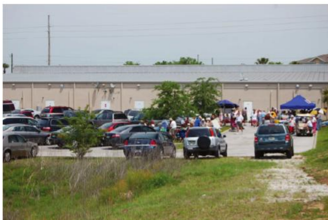
This photo was taken during one of our fund-raising activities at our 192 location.