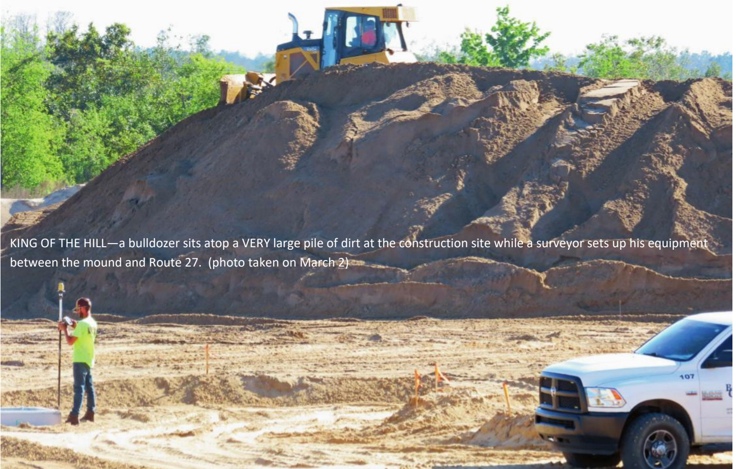
KING OF THE HILL —a bulldozer sits atop a VERY large pile of dirt at the construction site while a surveyor sets up his equipment between the mound and Route 27. (photo taken on March 2)