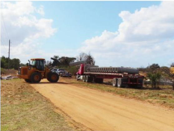
The first photo in the series shows the drainage pipes being taken off of the “delivery” truck. They are then transported down the road that leads to the church building and then placed with the others to be installed the first part of next week.