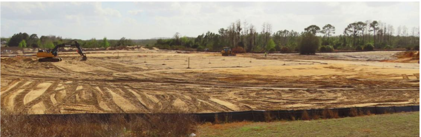
The area between the backhoe and the bulldozer is where the new church building will be...taken from the between our property and Siena Ridge. The front of the church will be to the right of this photograph and will face the parking lot. If you drive by and see the large dug out area, that is where a retention pond will be located.

For more photos, please go to our website at: Photo Albums (stfaustina.org) and check out the bulletin board in the back of the church for periodic updates.