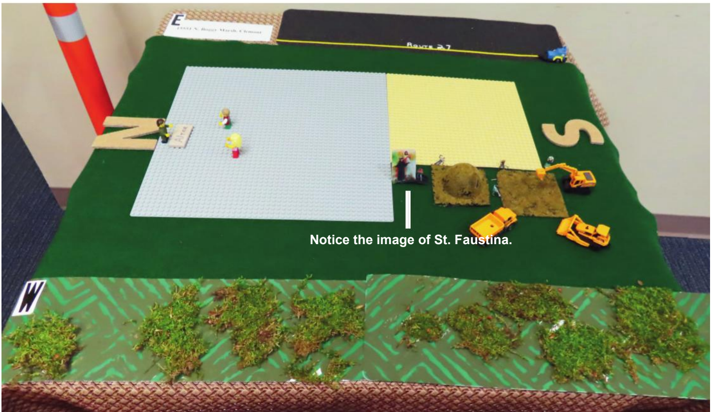
Notice the image of St. Faustina.