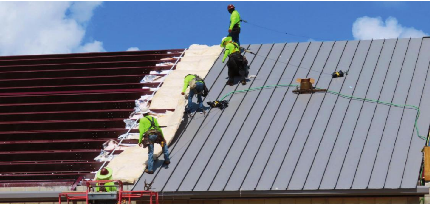
The week of Monday, July 4, to Friday, July 8, saw the roof start to take shape. The top photo is what you saw if you were driving past our new church building. The bottom photo is what you didn't see, but, just as importantly, is what was going on, simultaneously, inside. Also going on inside is the start of the duct work.