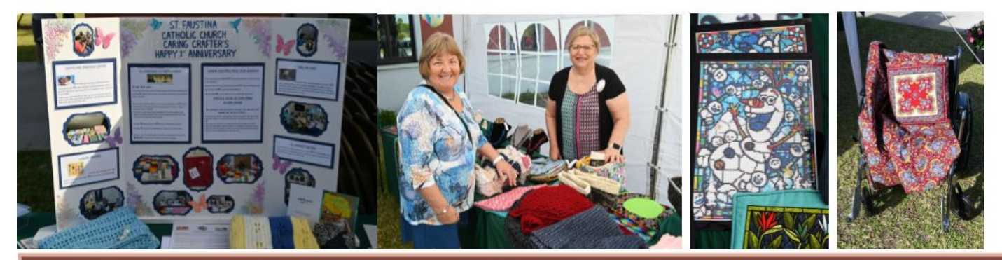
"He has endowed them with skill to execute all types of work: embroidering...weaving, and all other arts and crafts." Exodus 35:35