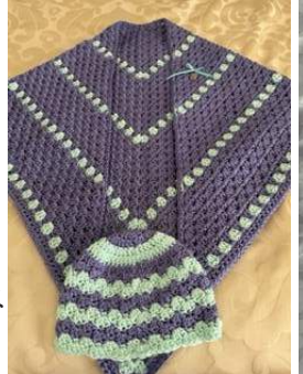
Prayer Shawl and Chemo Cap

I have only been meeting for three months, and with the help of donations, they have already made 13 prayer shawls for the Bereavement Ministry, 15 lap blankets for the Ministry to the Sick, and 10 baby blankets, bibs, booties and hats for the South Lake Pregnancy Center. fulfill the requests, they crochet and knit these items and it takes a lot of yarn. They are asking for your donation of yarn or gift cards to JoAnn work, fun, love, and fellowship during their Fabric, Michaels or Hobby Lobby to buy specific yarn for their projects.