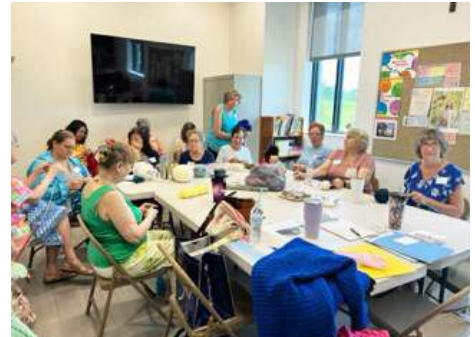
Members of the Caring Crafters combine, hard monthly meetings.

The Caring Crafters want to thank all those parishioners who donated yarn, fabric and supplies to their ministry. They