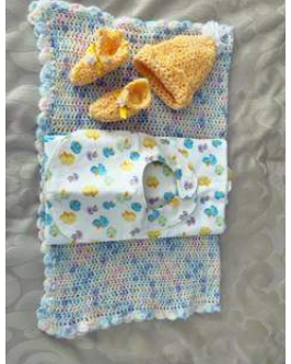
Baby blanket. bib and hat

If you would like to donate, you may bring your donation to the church any time during normal business hours ... and it is greatly appreciated.