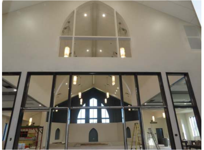
The left photo is how our worship space looked on June 29. The photo on the right is how it looked on Dec. 11.